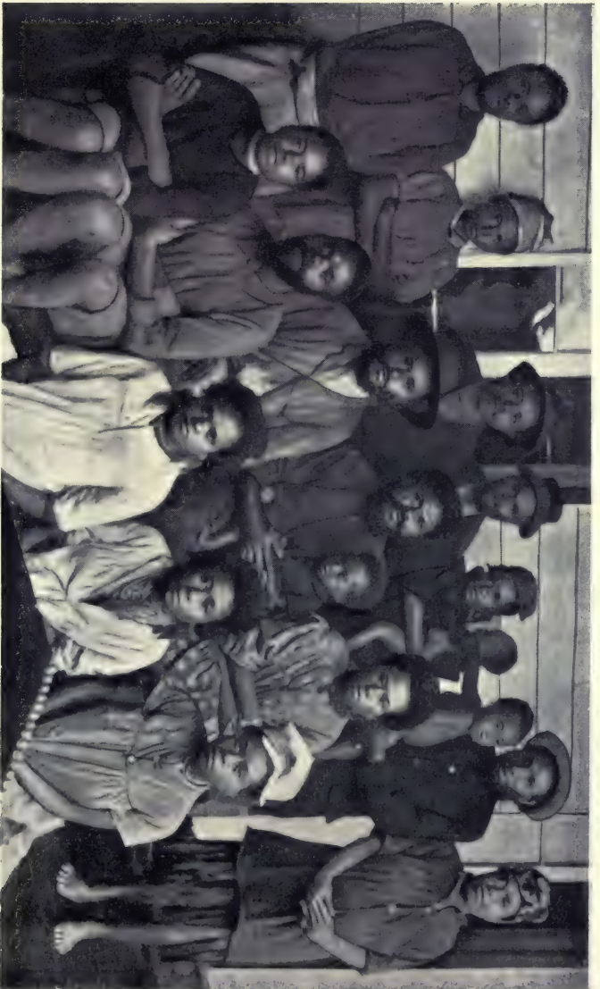
FIRST CANDIDATES CLASS